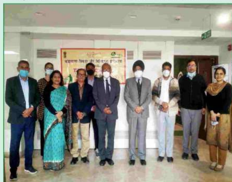
स्वच्छता पखवाड़ा दिनांक 16.02.2022 – को डब्ल्यू.डी.आर.ए के अधिकारीगण।

दिनांक: 16.02.2022- पखवाड़े का शुभारंभ किया गया। इस दौरान कार्यालय के कर्मचारियों के द्वारा स्वच्छता की शपथ ली गयी और साथ ही कार्यालय में पौधा रोपण का कार्य सम्पन्न किया गया।