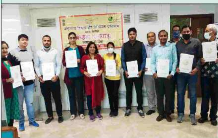
स्वच्छता पखवाड़ा के दौरान पेपर फोल्डर के उपयोग को बढ़ावा देते डब्लूडीआरए अधिकारीगण।

दिनांक : 25.02.2022 - पखवाड़े के दौरान कार्यालय के पदाधिकारियों और कर्मचारियों द्वारा कार्यालय के परिसर का निरीक्षण किया गया और साथ ही प्लास्टिक के उपयोग को कम करने के लिए प्लास्टिक फोल्डर को हटाया गया तथा पेपर फोल्डर (Paper Folder) के इस्तेमाल करने का सुझाव दिया गया।