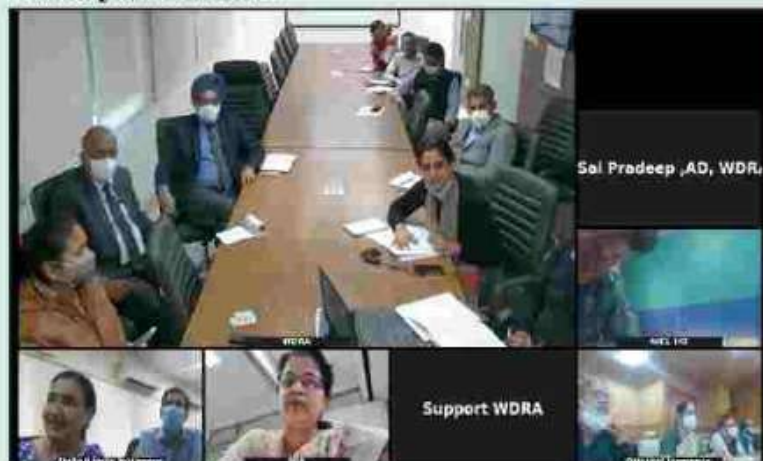
WDRA officers and representatives of four public sector insurance companies during online video conference.

It was informed that WDRA registered warehouses need to have three types of Insurance coverage i.e., Fire and Special Perils, Burglary and Fidelity at all times. WDRA's risk mitigating factors like mandatory requirement of security guards, quality control staff, fire fighting equipments, BIS/CWC/FCI standard infrastructure, boundary wall/barbed fencing, overhead water tank in case of hazardous goods, minimum net worth requirement as per capacity of warehouses, issuance of e-NWR on repository system, physical inspection of warehouses before registration to cross check information submitted to the WDRA portal, periodical inspections, risk based surprise inspections, mandatory SOPs, etc were explained to them